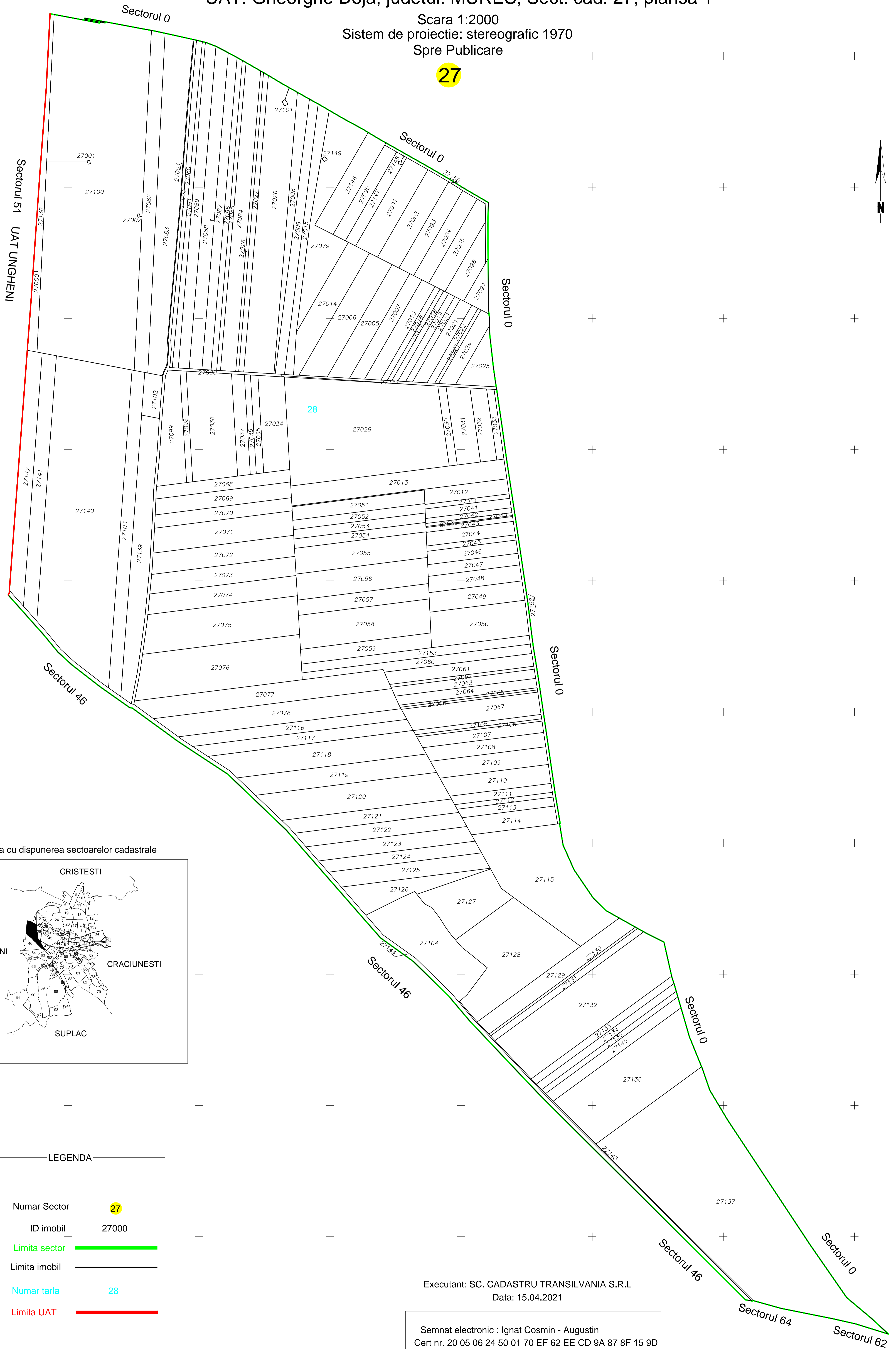
Schita cu dispunerea sectoarelor cadastrale